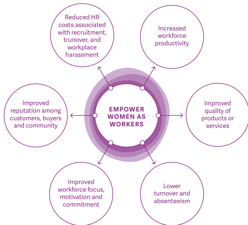
Figure 3: The Business Case for Empowering Women as Workers

Expanding and strengthening women's workforce participation and leadership can benefit companies in terms of access to an increased and more diverse labour pool and skills, which can result in reduced operating costs and increased business returns. The following activities offer good entry points for improving women's workforce participation and empowerment in the workplace: