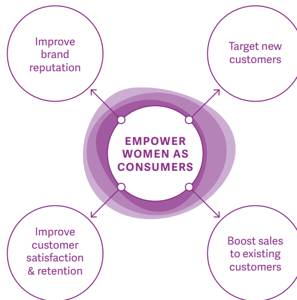
Figure 2: The Business Case for Empowering Women as Consumers

By tailoring their products and services to the needs of female consumers, firms can achieve significant market growth, improve customer satisfaction and retention and grow their brand's reputation. In terms of collaborating with consumer-facing firms (i.e. retail or service companies) and demonstrating to them the business opportunity relating to women as customers, the following activities can serve as good entry points: