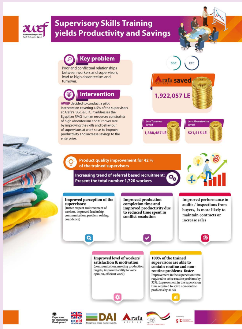
Figure 4: Results of AWEF's RMG Intervention