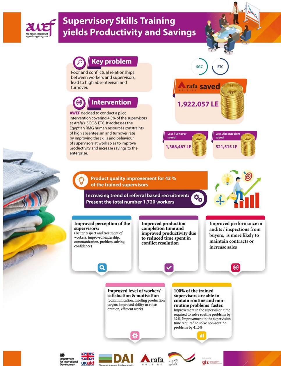
Figure 4: Results of AWEF's RMG Intervention