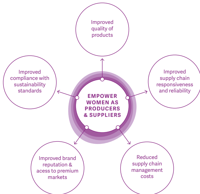
Figure 5: Business Case For Empowering Women Producers and Suppliers

Improving opportunities for women as producers and suppliers can help firms improve their reputation and compliance on social responsibility aims and deliver commercial benefits by improving productivity, quality, and reliability of their supply chains. The following activities offer good entry points for building this business case: